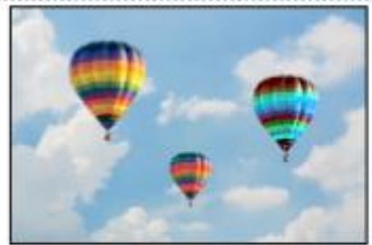
Hot air balloon