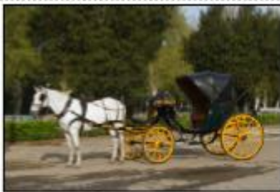
Horse and carriage